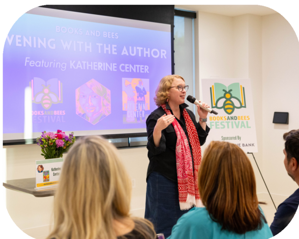
Author Katherine Center speaking at Keystone Bank