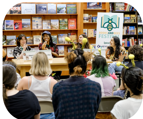
Young Adult author panel led by Bee Cave teens at Barnes & Noble